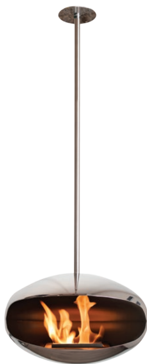
CFASS with 316 Stainless Steel Hanging System