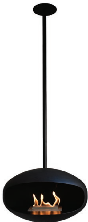
CFABBLK with Black Hanging System